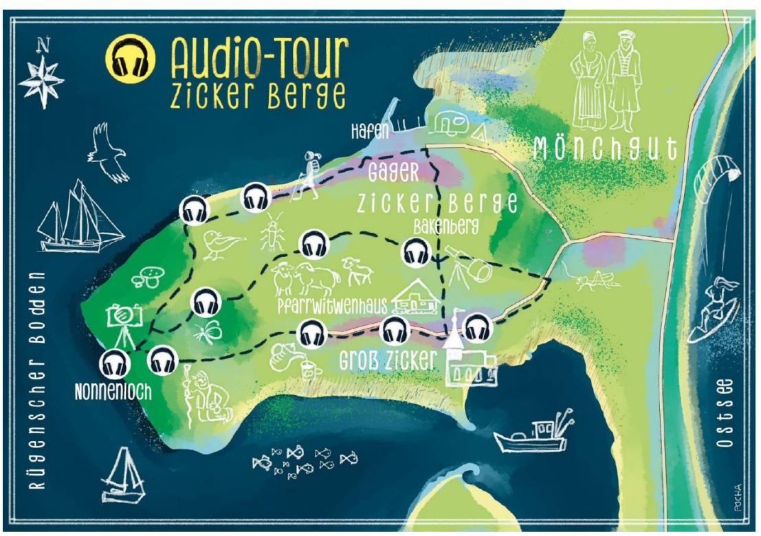
BRASOR: Promotional Postcard, Hiking trail and Audio-Stations in the Zicker Bergedeoped at the Biosphere Reserve South east Rügen within the Interreg Central Europe Project CEETO.

CEETO Project final Conference: https://www.dunc-heritage.eu/ceeto-projectinspirational-final-conference-and-projectsresults/