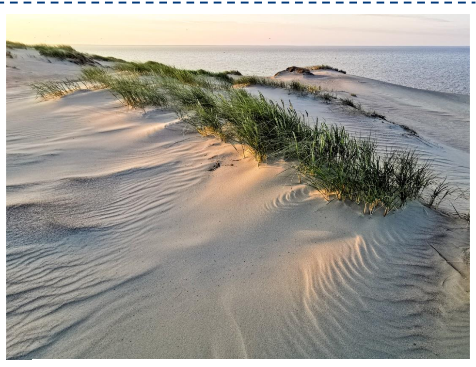
Sunrise over the dunes of the Curonian Spit